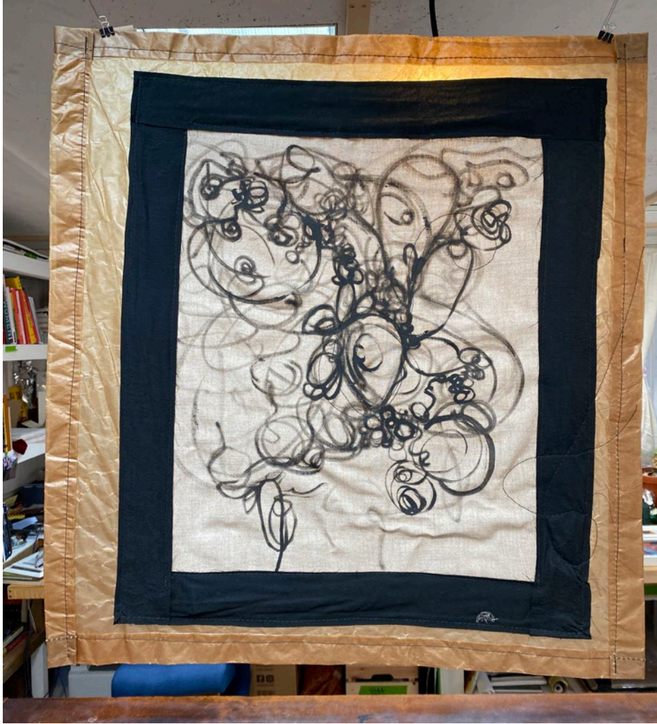
The Novel of my Body. 2023 oil on Belgian linen on Kraft paper with stitching and antique kimono fabric. 68 x 75cm (above: view 1, below: view 2)