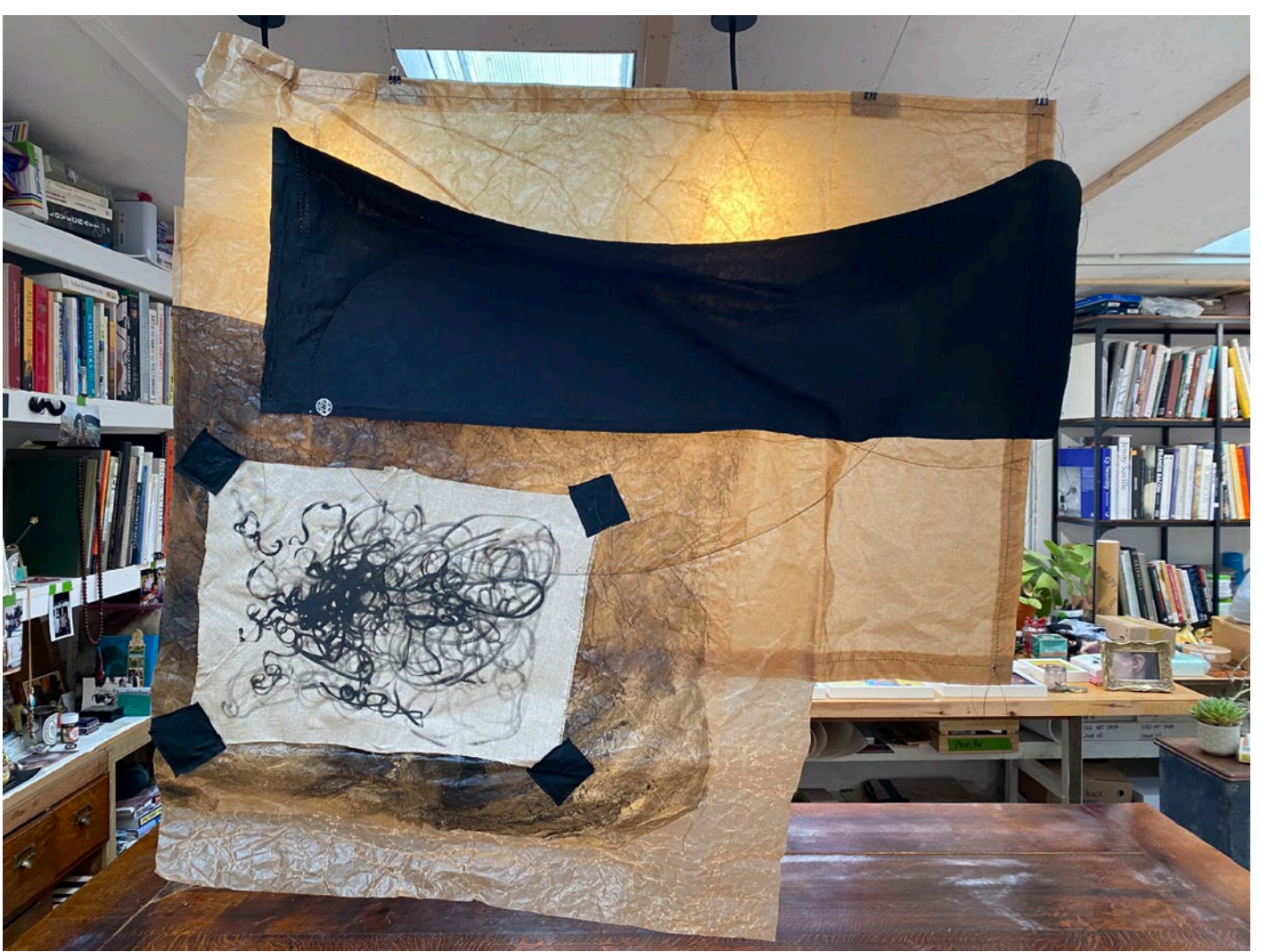
Thought Gesture with After Thought. 2022. Oil on sutured Belgian linen, oil, stitching and antique kimono silk on Kraft paper. 115 x 115 cm (above: installation view 1, below: installation view 2)