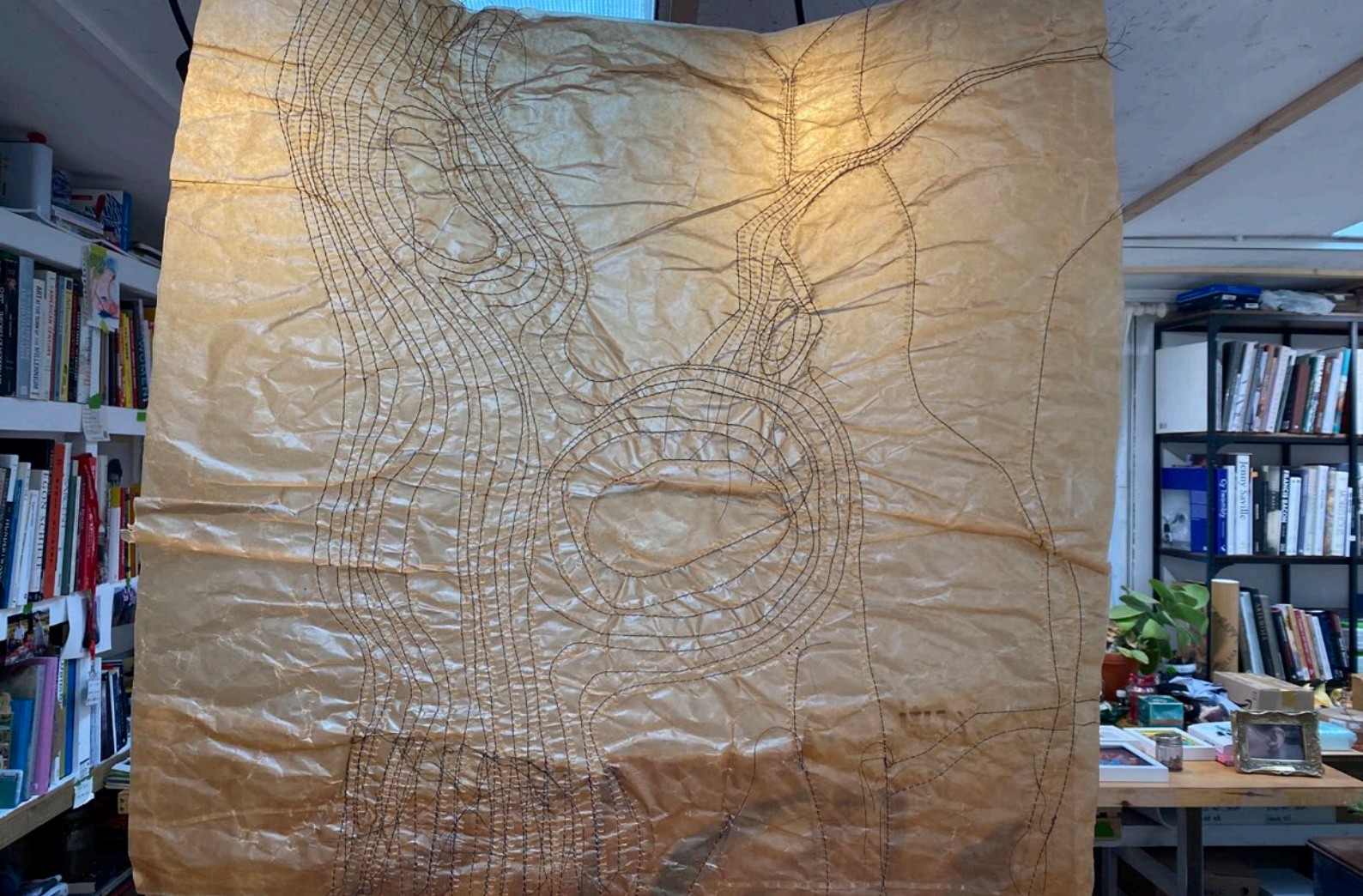
Half a treetop. 2022. stitching on kraft paper, 83 x 80 cm. (Below: detail view)