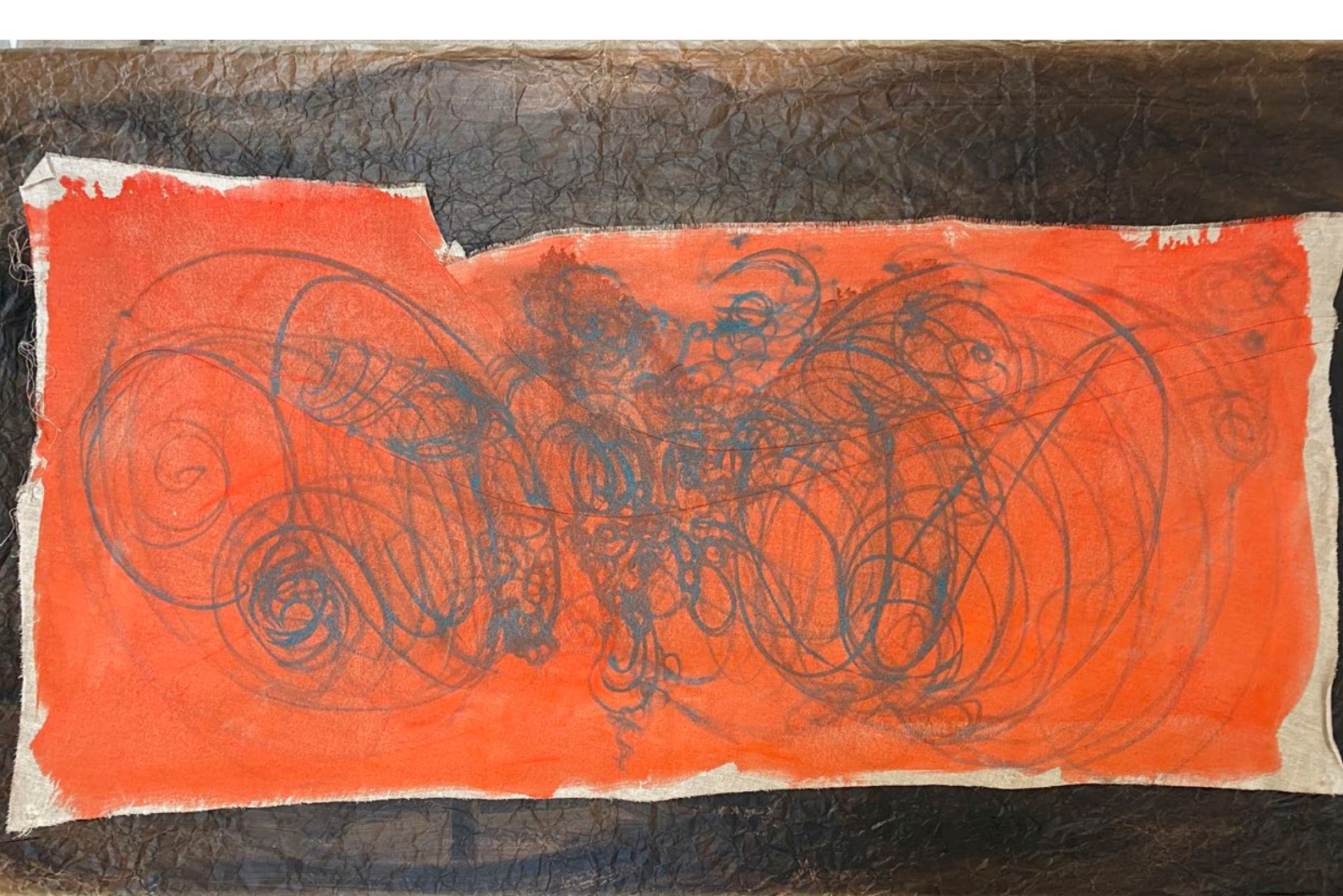
Thought Gesture - Red on Black on Blue. 2023. Oil on kraft paper, oil on sutured Belgian linen. 88 x 160 cm. (Above: on table. Below: detail)