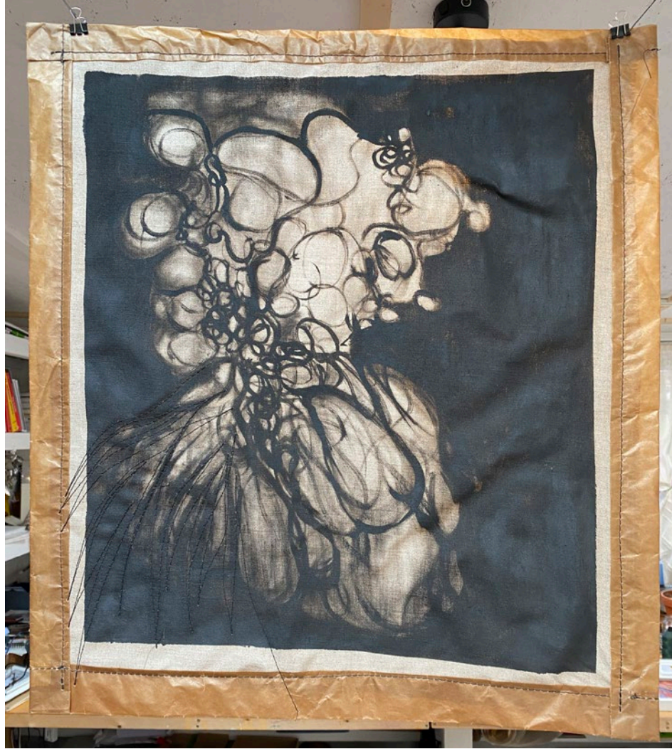
Portrait of the Master, sutured. 2023 oil on Belgian linen on Kraft paper with stitching 54 x 60 cm (above: view 1, below: view 2)