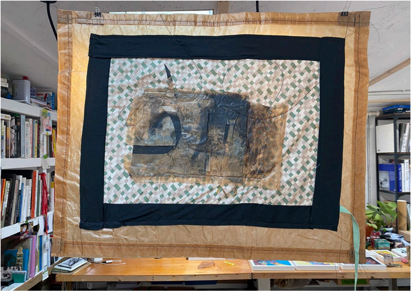
Hospital Bankie. 2022. Oil on hospital gown with antique kimono fabric on stitched kraft paper. 60 x 74 cm (above: installation view 1, below: installation view 2)