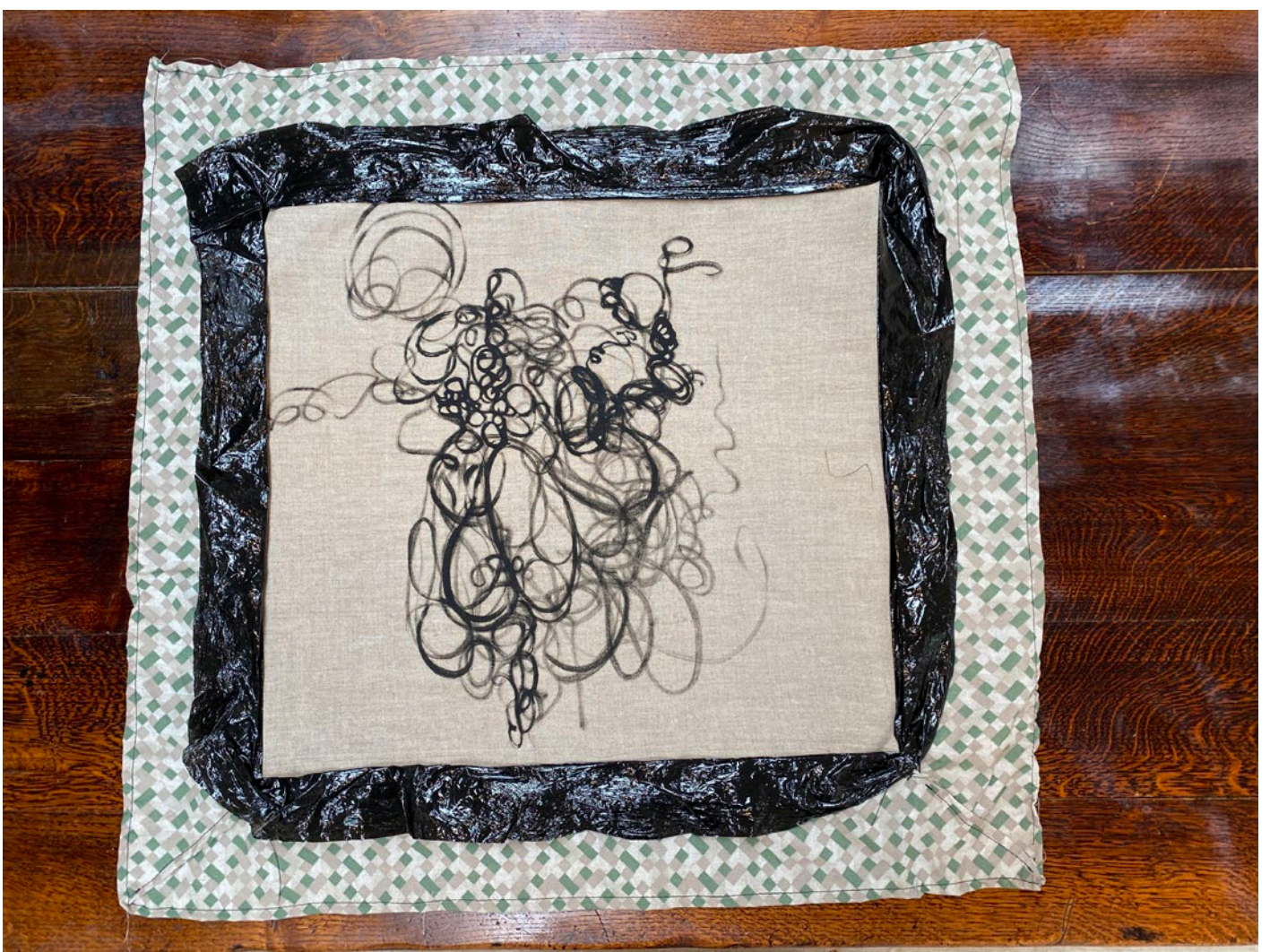
Above: It's not nothing. 2022. Oil on Belgian linen with recycled packaging on hospital gown. 74 x 74 cm Below: view 2, hanging.