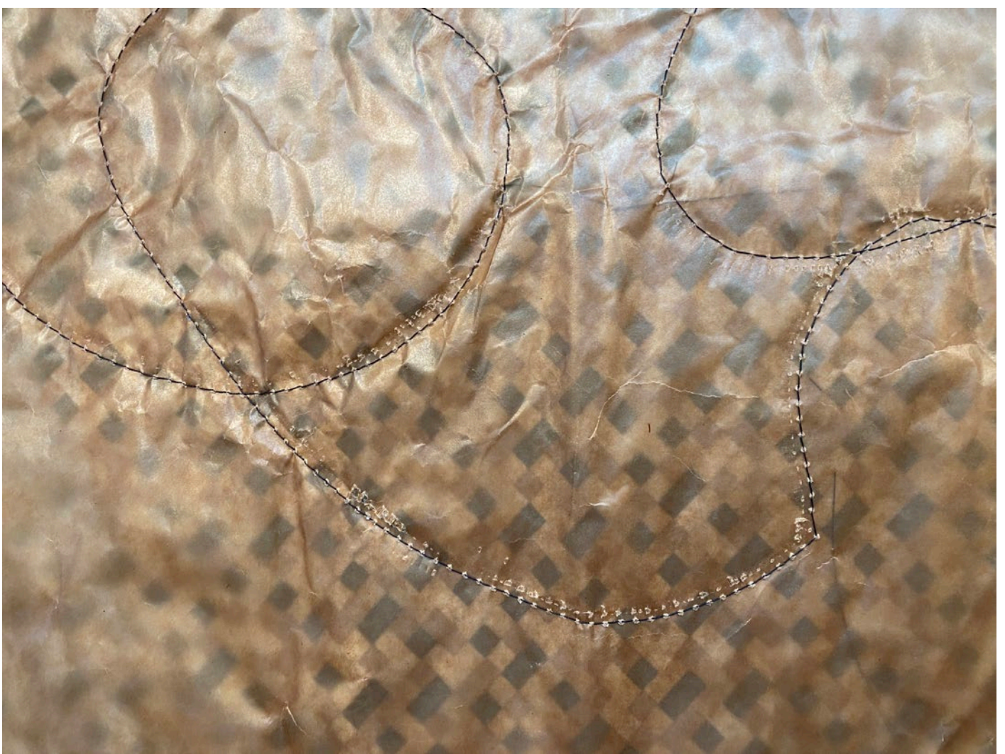
Above: Hospital Bankie. 2022. Oil on hospital gown with antique kimono fabric on stitched kraft paper. 60 x 74 cm (detail view) Below: Portrait of the Master, sutured. 2023 oil on Belgian linen on Kraft paper with stitching 54 x 60 cm (detail view)