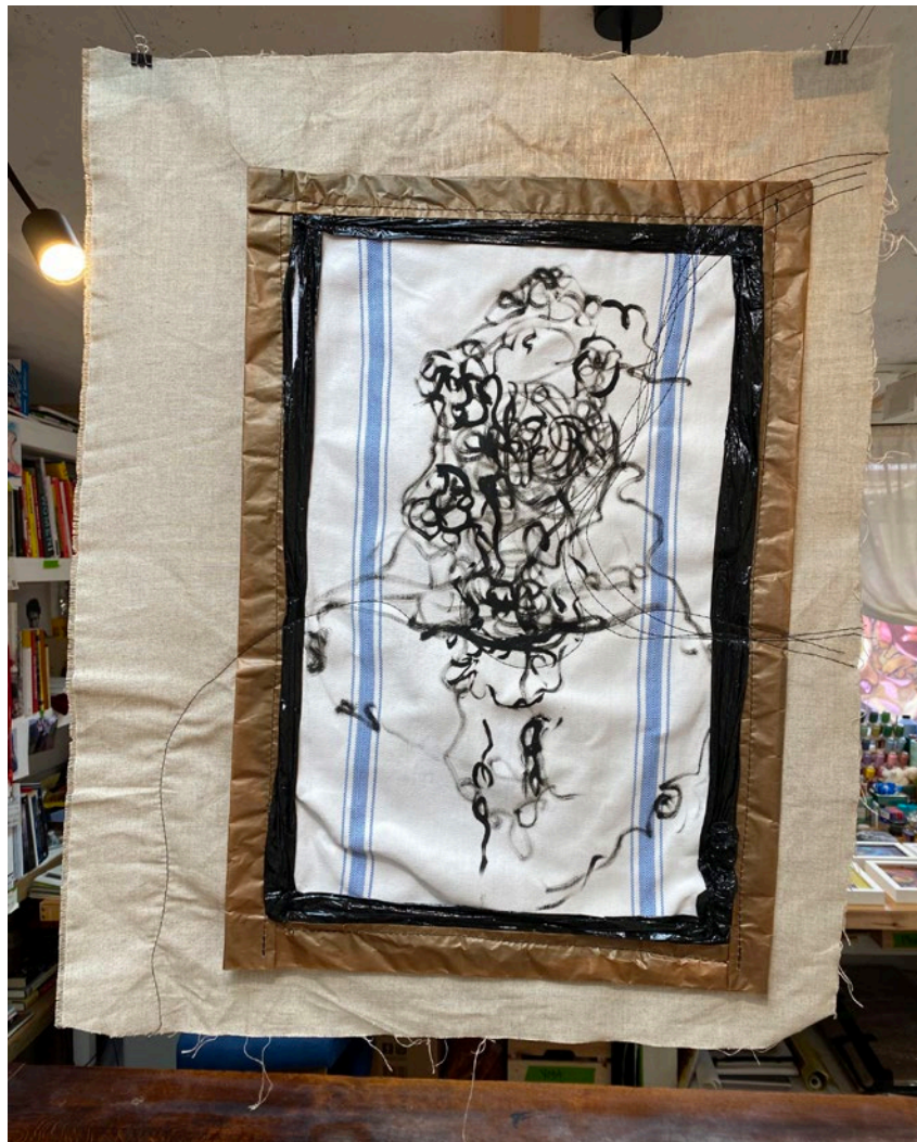
Tea with a side of Pain Map. 2022. Oil on tea towel with recycled packaging wrapper, kraft paper, and stitching on Belgian linen. 59 x 74 cm (Above: view 1, Below: view 2)